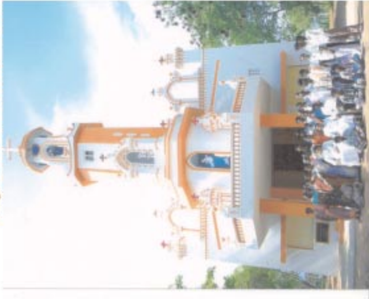
Oblates Organize Diocesan Lenten Pilgrimage at V.C.Kurusady - 5000 people participate

Congrats to the Oblate Restors and Preachers in the shrine